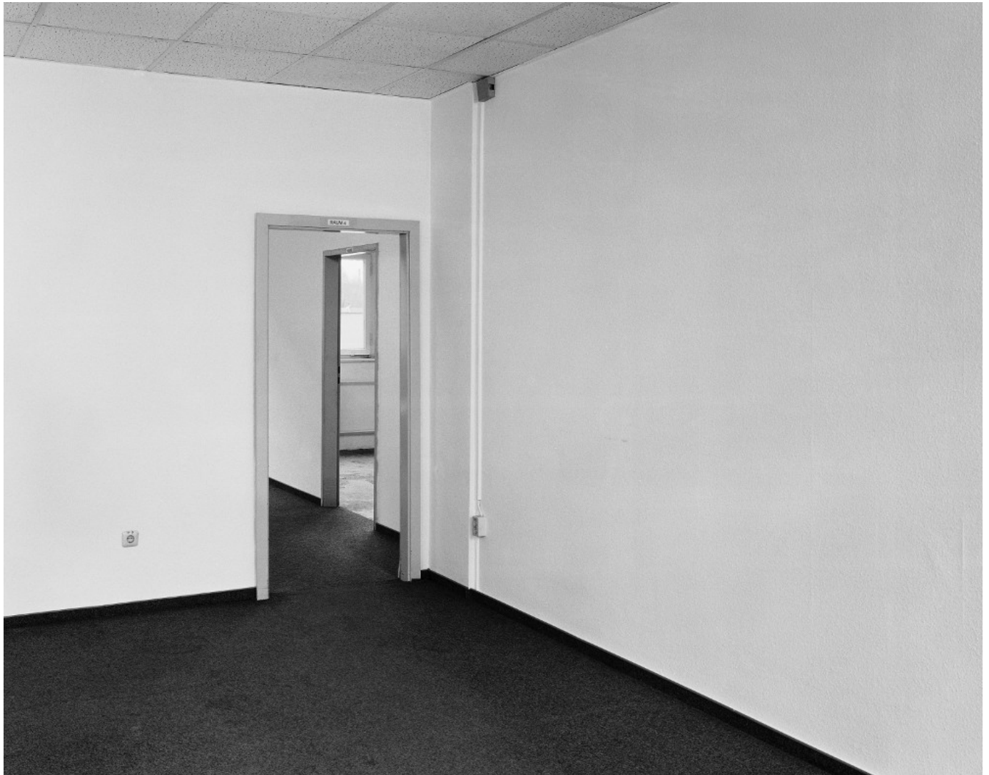
Florian Slotawa, Atelier (Raum II, 2) , 2009 © Florian Slotawa / VG Bild-Kunst, Bonn 2017